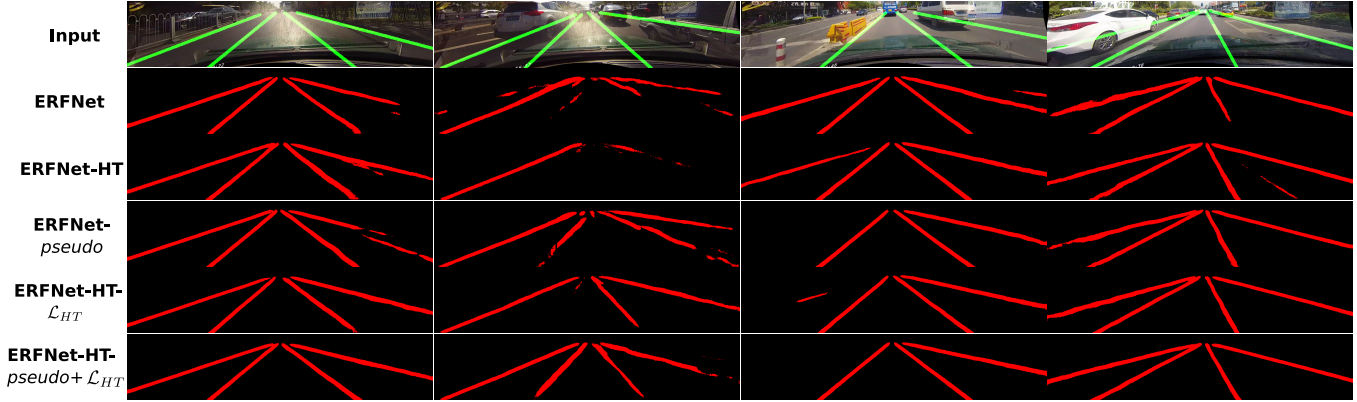
Fig. 2: Visualizations of predicted lanes on the CULane dataset. Only 10% annotated data is used for training. ERFNet-HT- pseudo+\mathcal{L}_{HT} performs better on challenging samples and better localizes lane boundaries. The inference speed of the ERFNet-HT is around 13 frames per second on a NVIDIA GTX1080Ti GPU.